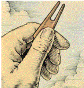
Use a pronged ball mark repair tool, knife, key or tee.