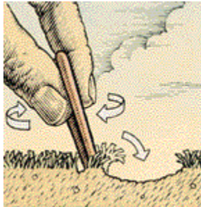
Bring the edges together with a gentle twisting motion, but don't lift the center. Try not to tear the grass.